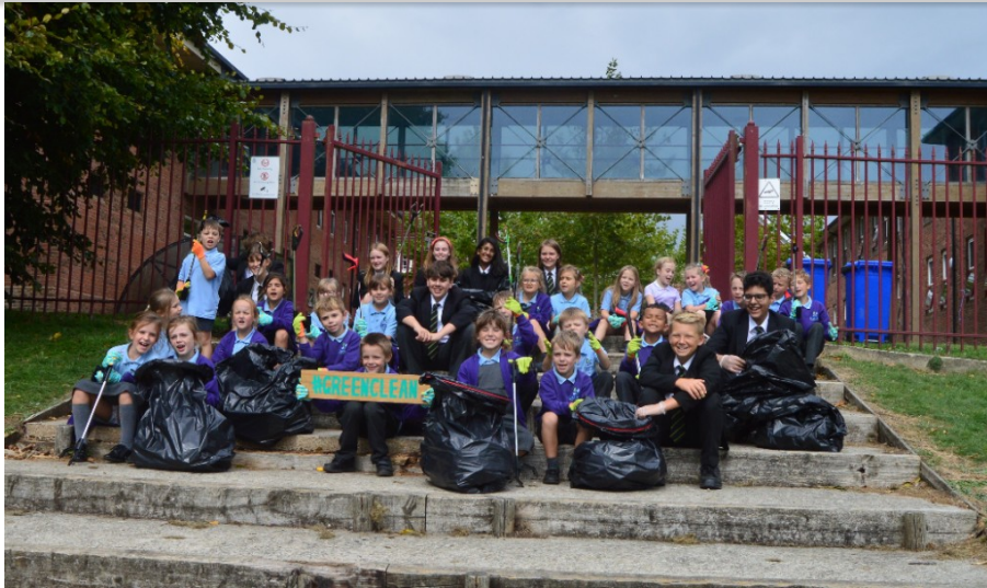
Photo: Damers First School took part in a litter pick in collaboration with The Thomas Hardy School.